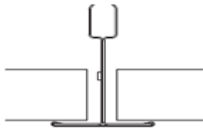
Square edge (SQ)